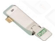
DHL005 PUSH PAD LATCH