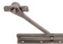
DHL019 DOOR OPENING RESTRICTOR