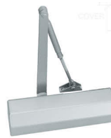
DHC002 RYOBI DOOR CLOSER