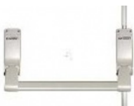
DHL017 PANIC BOLT SINGLE DOOR EXIDOR 294 (0210073701)