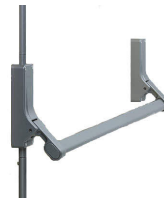
DHL003 DOUBLE PANIC BOLT SINGLE DOOR TYPE (BRITON 376 OEM/SE)