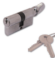
DHL021 EURO CYLINDER KEYED & THUMB TURN