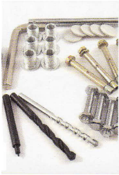
DHA001 STEEL DOOR ACCESSORY PACK